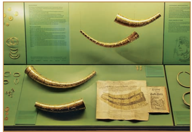
Golden horns of Gallehus in the National Museum in Copenhagen

Gjallarhorn is usually pictured as a lur , the ancient bronze trumpet of SCANDINAVIA, dating back to about 1000 B.C. Lurs were made in pairs, twisting in opposite directions so that the two held side by side looked like the horns of a large animal. Some lurs have been excavated from the peat bogs of DENMARK and can still be played.