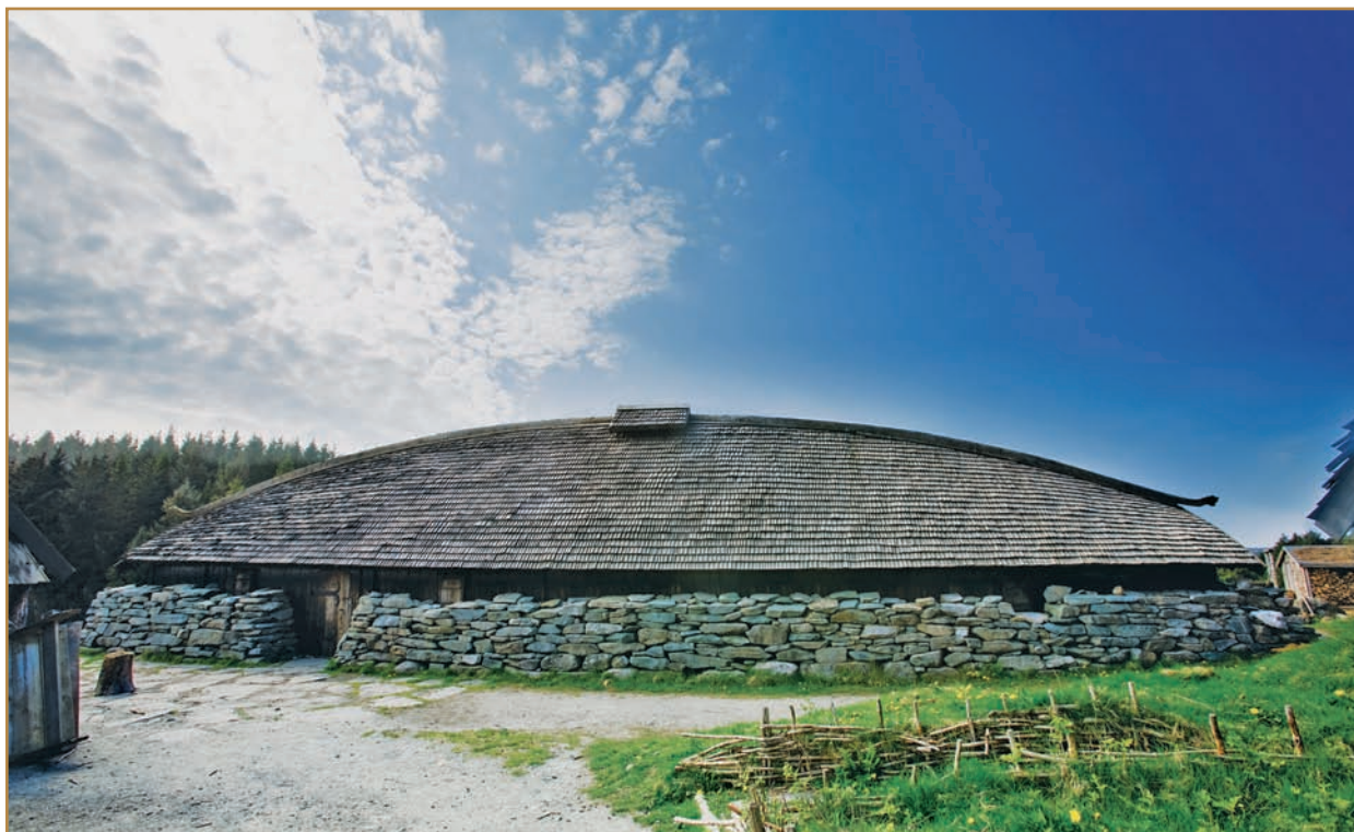
A Viking longhouse on the coast of Norway

Their mythological and heroic legends form the content of Old NORSE literature. The Viking Age ended, however, in the 12th century with the coming of Christianity to SCANDINAVIA and the rise of European states, whose people were able to join together and protect themselves against further Viking invasions and raids. Many Vikings settled down in the lands that they had raided.