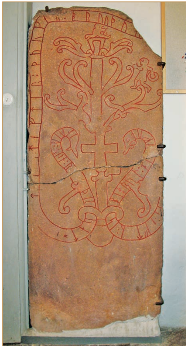
Depiction of Andvari the dwarf (upper right) on a runestone

ANDVARI The DWARF whom LOKI, the trickster god, robs of his hoard of gold. Andvari had put a curse upon his treasure, including the ring, which