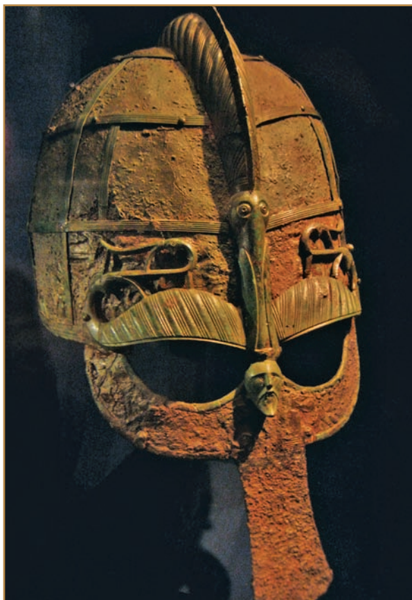
A Migration Period iron helmet excavated from a boat grave in Vendel, Uppland, Sweden

Those peoples most connected with the mythology now known as NORSE were well established on the Scandinavian peninsula and in DENMARK at the beginning of this period. They spread with other tribes, extending their reach to GREAT BRITAIN, the FAROE ISLANDS, ICELAND, and even Ireland. This migration was recorded by Roman writers such as the historian Tacitus and later by the Danish historian SAXO GRAMMATICUS.