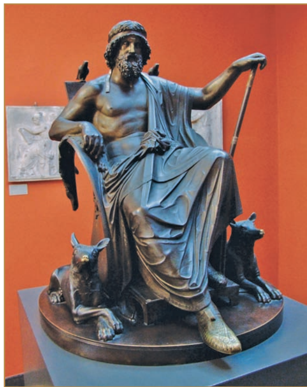
Odin (1825–1827) by H.E. Freund in Copenhagen, Denmark

Odin was also thought of as a magician, for he was a master of the magic songs known as GALDRAR . He knew the secrets of the RUNES (the earliest alphabet used by the Norse), which he had obtained by hanging himself from the World Tree, YGGDRASIL . For this reason he is sometimes called Lord of the Gallows (see below).