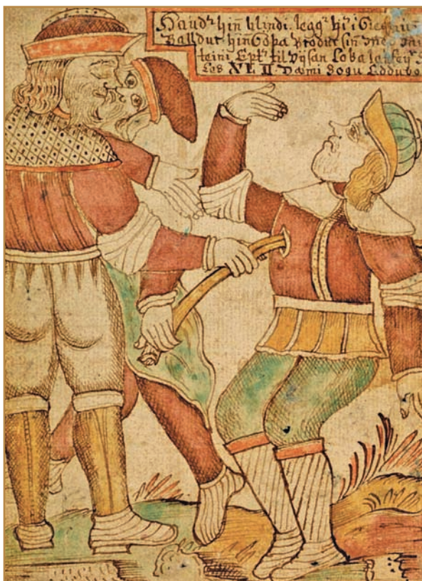
Hodur in the act of killing Balder with a sprig of mistletoe. From the 18th-century Icelandic manuscript SÁM 66, in the care of the Árni Magnússon Institute in Iceland

Hoenir is associated with Odin and LOKI in the stories “Idunn's Apples” (see under IDUNN) and