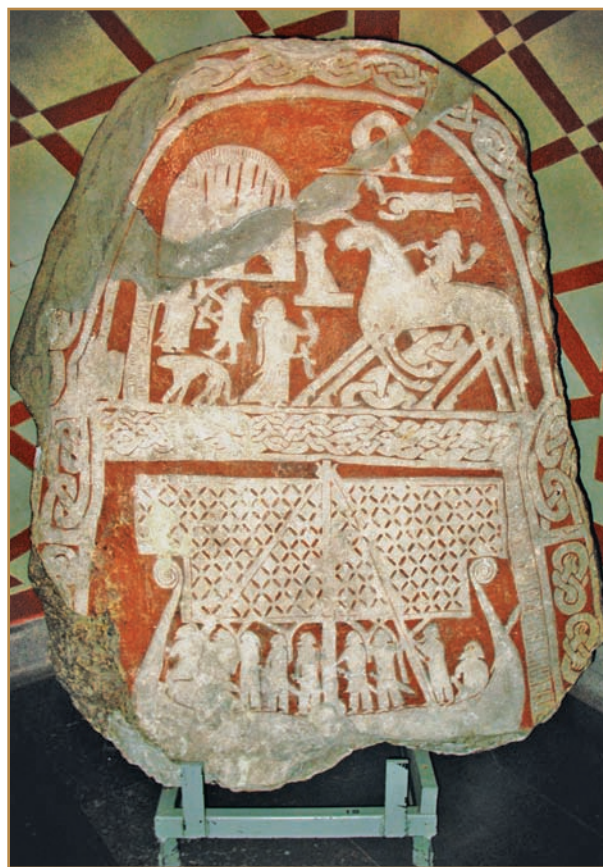
The upper right corner of this runestone depicts Odin riding the eight-legged horse, Sleipnir.

SKY In the NORSE CREATION myth, the sky was made from the dome of the giant Ymir's skull. It was held up at the corners by four DWARFS, NORDI, SUDRI, AUSTRI, and VESTRI. It was lit by the SUN and the MOON (see "Sun and Moon," under CREATION); the stars were created from sparks borrowed from MUSPELLHEIM, the land of fire; and it was shaded by clouds made from Ymir's brains.