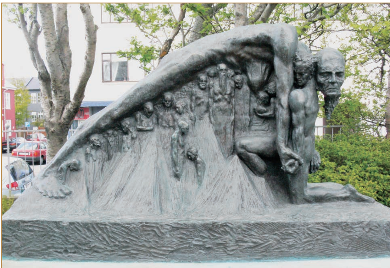
Thor Wrestling with Age. Sculpture by Einar Jónsson (1873–1954), Reykjavik, Iceland

Leipt, Slid, Syol, Sylg, Vid, and Ylg. The rivers froze and roared into GINNUNGAGAP, the abyss, as glaciers. The first giant, YMIR, was formed from the frozen poison of the Elivagar (see CREATION).