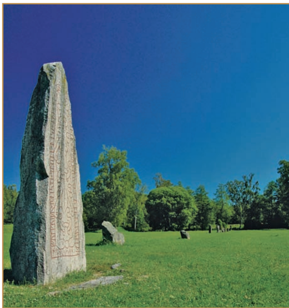
Burial site from about A.D. 500 in Anundshög, Sweden

Archaeological finds and a significant number of Norse artifacts from Sweden have helped scholars