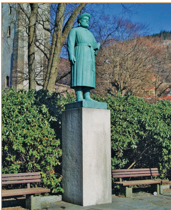
Statue of Snorri Sturluson by Gustav Vigeland, in Bergen, Norway

SOL (Sun) According to 13th-century Icelandic poet SNORRI STURLUSON, a servant of the SUN. Sol was the daughter of the human MUNDILFARI and the sister of MANI. The gods stole Sol and Mani from their father when they were children—or perhaps young adults, since Snorri says Sol was married to a man named GLEN. The gods were offended that a HUMAN, Mundilfari, had named his children after the Sun and the Moon.