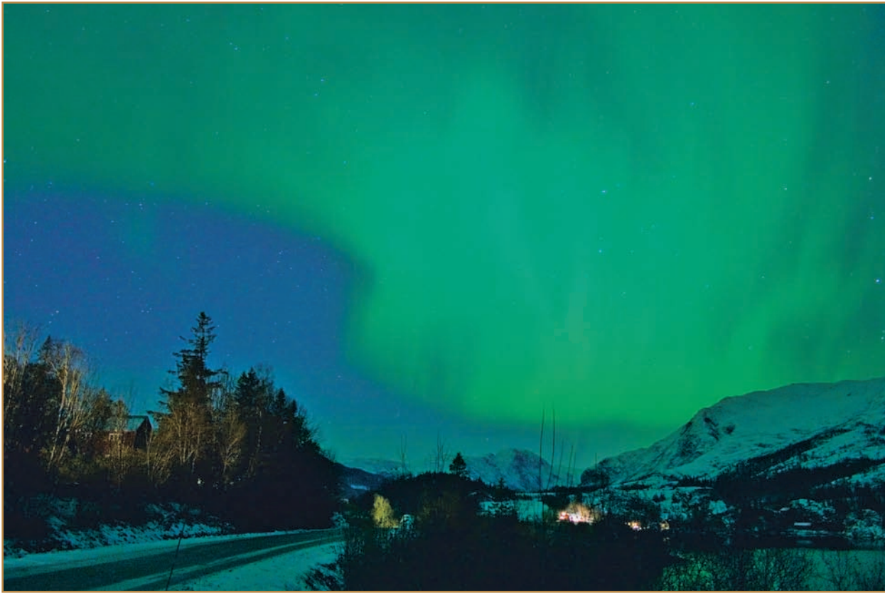
Aurora borealis in Norway

Aurvandil's Toe. The story is in SNORRI STURLUSON's SKALDSKAPARMAL .