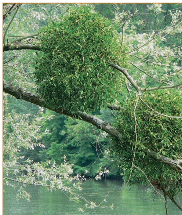
Mistletoe plant growing in a tree. Hodur used a sprig of mistletoe to kill the god Balder.

For many centuries, Norsemen wore the hammer's likeness as an amulet. Many of these amulets have been discovered in archaeological digs in SCANDINAVIA and Great Britain. Many ancient gravestones and RUNE stones also depict Thor's hammer.