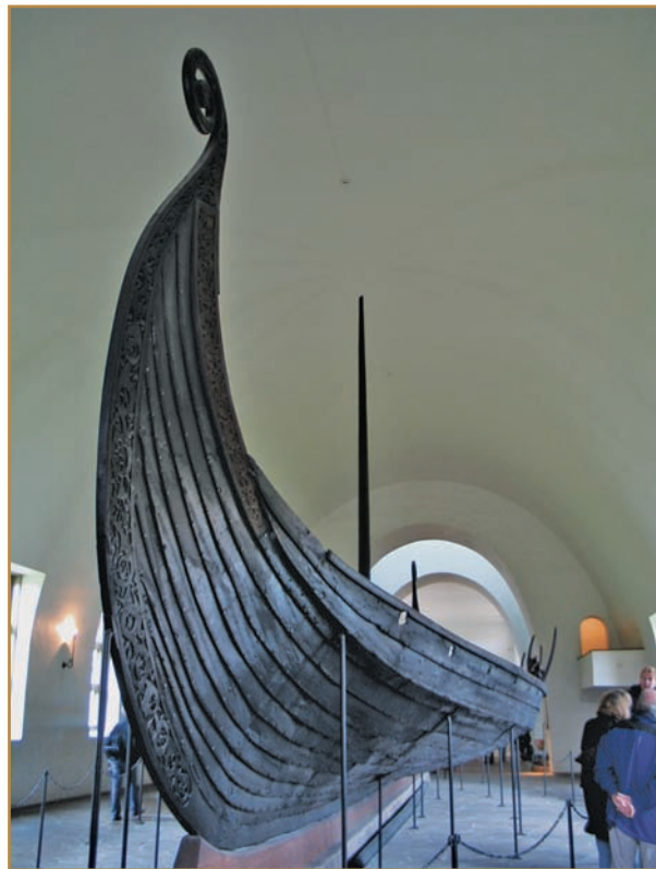
The Oseberg ship in Oslo, Norway

Norway features many archaeological sites to provide evidence of the worship of the NORSE gods. Bronze Age rock carvings near Kalnes, Norway, show men in boats and Sun images. At least three burial ships from the VIKING AGE (about A.D. 800–1000) have been uncovered near Oslo. The Oseberg ship,