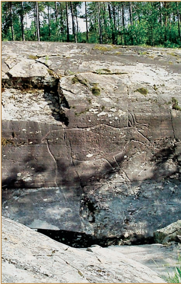
This rock carving of a deer is one of the major features of the Bolareinen ( Bola reindeer ) rock carvings site in Steinkjer, Norway.

which is found in the POETIC EDDA , and in SNORRI STURLUSON'S GYLFAGINNING .