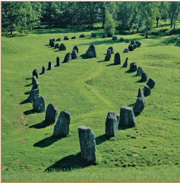
Burial mound in the shape of a sailing ship in Anundshög, Sweden

grew within King Volsung's hall. Only SIGMUND, son of Volsung, could draw the sword from the tree. After the sword was broken into shards in a battle between Odin and Sigmund, the dwarf REGIN put the pieces