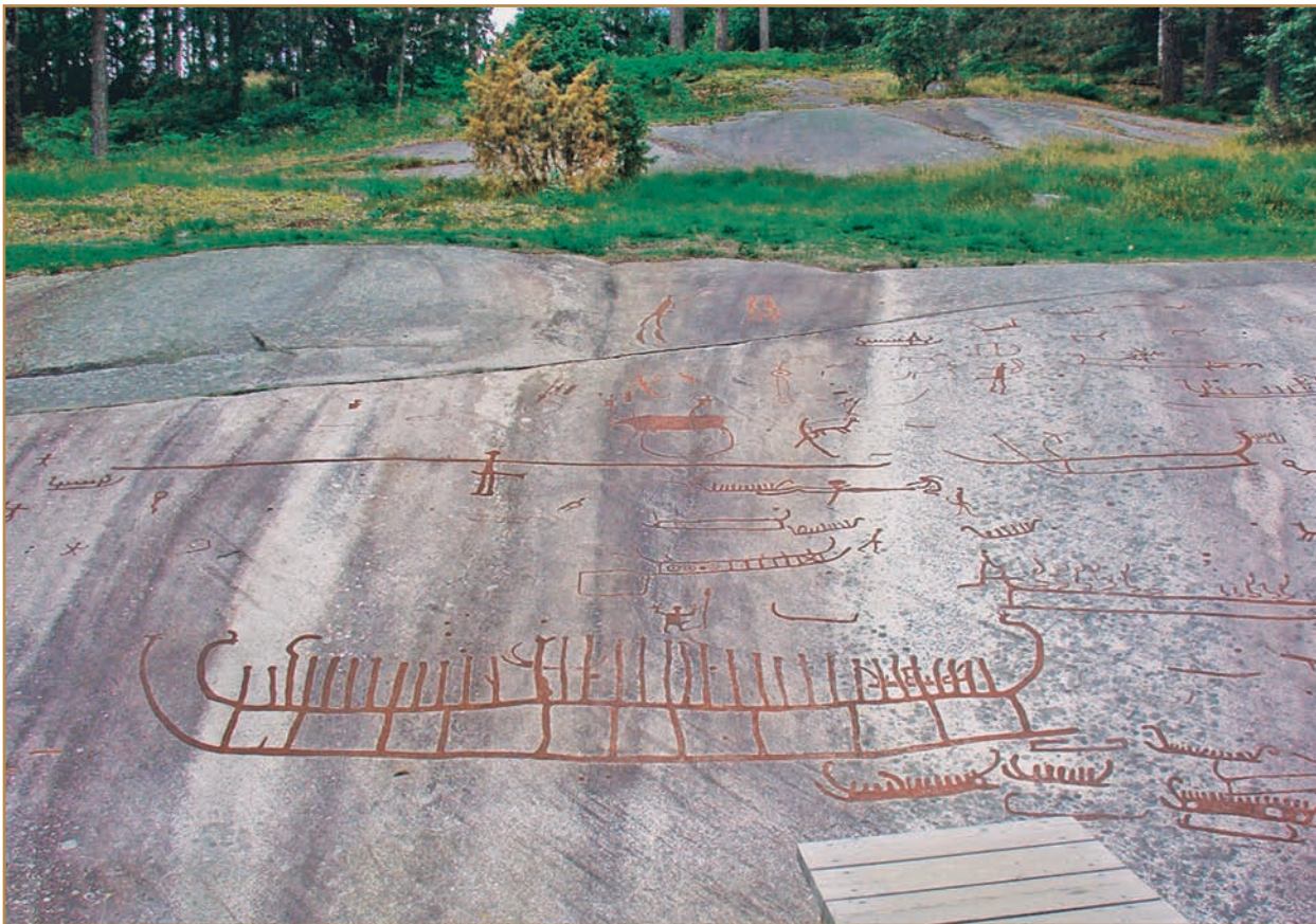
The flat rock of Vitlycke in Sweden depicts a large ship, some smaller boats, and a man with long arms.

The Norse myths were not written down, however, until the 13th century, by which time Christianity was established in northern Europe and had displaced paganism, that is, the worship and the myths of the ancient gods. Thus much of the ancient lore is lost to modern audiences. What remains is fragmented, incomplete, and often distorted by the pious Christian monks who edited the pagan tales as they transcribed them onto vellum and parchment for the first time. Although the Norse myths as we know them today are often confusing and contradictory, they still present us with wonderful tales about these northern people. The more you learn of them, the less confusing they become.