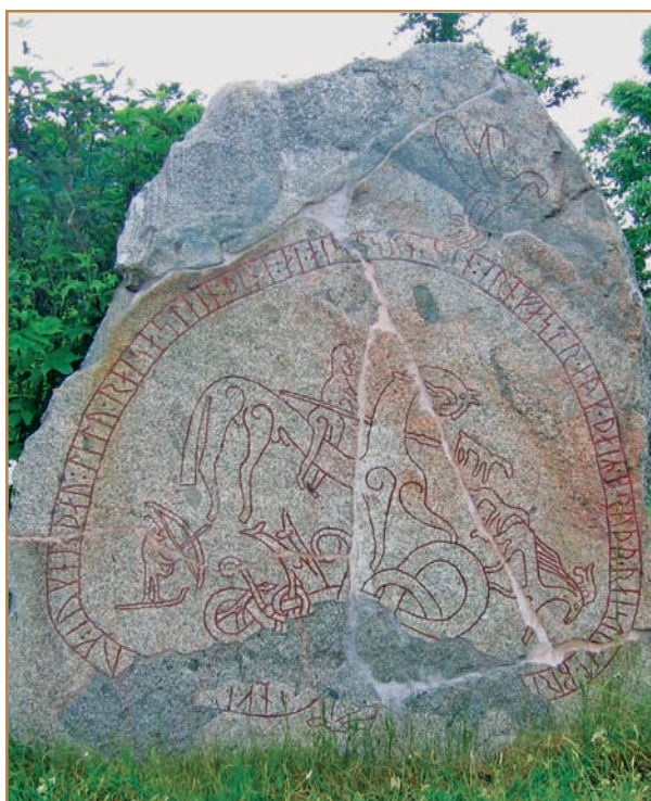
Runestone in Uppland, Sweden, depicting Ull on skis

After the wood temple, worshippers built a gold building, according to Adam of Bremen. In the center stood an image of Thor, and on either side of him were