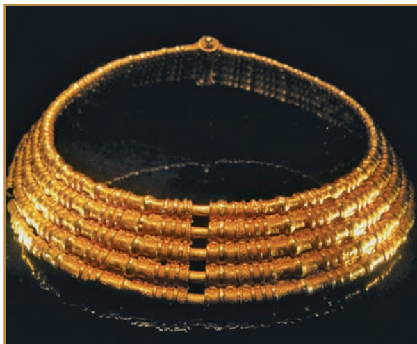
A golden necklace, ca. 300–700, found in Torslunda, Färjestaden, Sweden

Freya lent the Brisinga men to THOR to help him retrieve his hammer, MJOLLNIR, from the RIME-GIANT THRYM. This story is told in the poem THRYMSKIVTHA , which is part of the CODEX REGIUS of the POETIC EDDA .