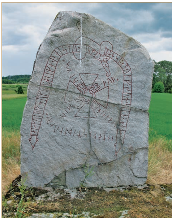
The figure of a serpent is depicted on this runestone in Liflinge, Sweden, a commemoration of a Viking sailor who died in Ingvar the Far-Traveller's expedition to the Caspian Sea.

SHIPS AND SHIP BURIALS Ships were an important part of NORSE culture. The Norse depended on ships not only for fishing and trading but for expanding their empires. The VIKING seafarers roamed from their northern strongholds as far south as the Iberian peninsula (modern Spain and Portugal), Italy, and Sicily and as far east as Russia, Constantinople, and Baghdad. A Viking navigator, Leif Eriksson, sailed to North America in about the year 1000, almost five centuries before Christopher Columbus set foot in