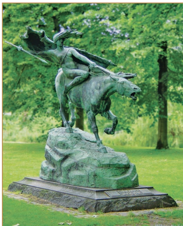
Statue of a Valkyrie in Copenhagen, Denmark, by Norwegian sculptor Stephan Sinding (1846–1922)

The German composer Richard Wagner wrote an opera The Valkyries ( Die Walküre ) as part of the Ring des Nibelungen cycle. In it Brunhilda is chief of the Valkyries. Wagner's "Ride of the Valkyries" is cited as one of the most stirring pieces of 19th-century orchestral music.