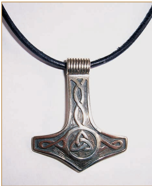
A decorative reproduction of Thor's hammer, Mjollnir

With Mjollnir, Thor killed the giant HRUNGNIR and also the GIANT MASTER BUILDER, who built Asgard's wall.