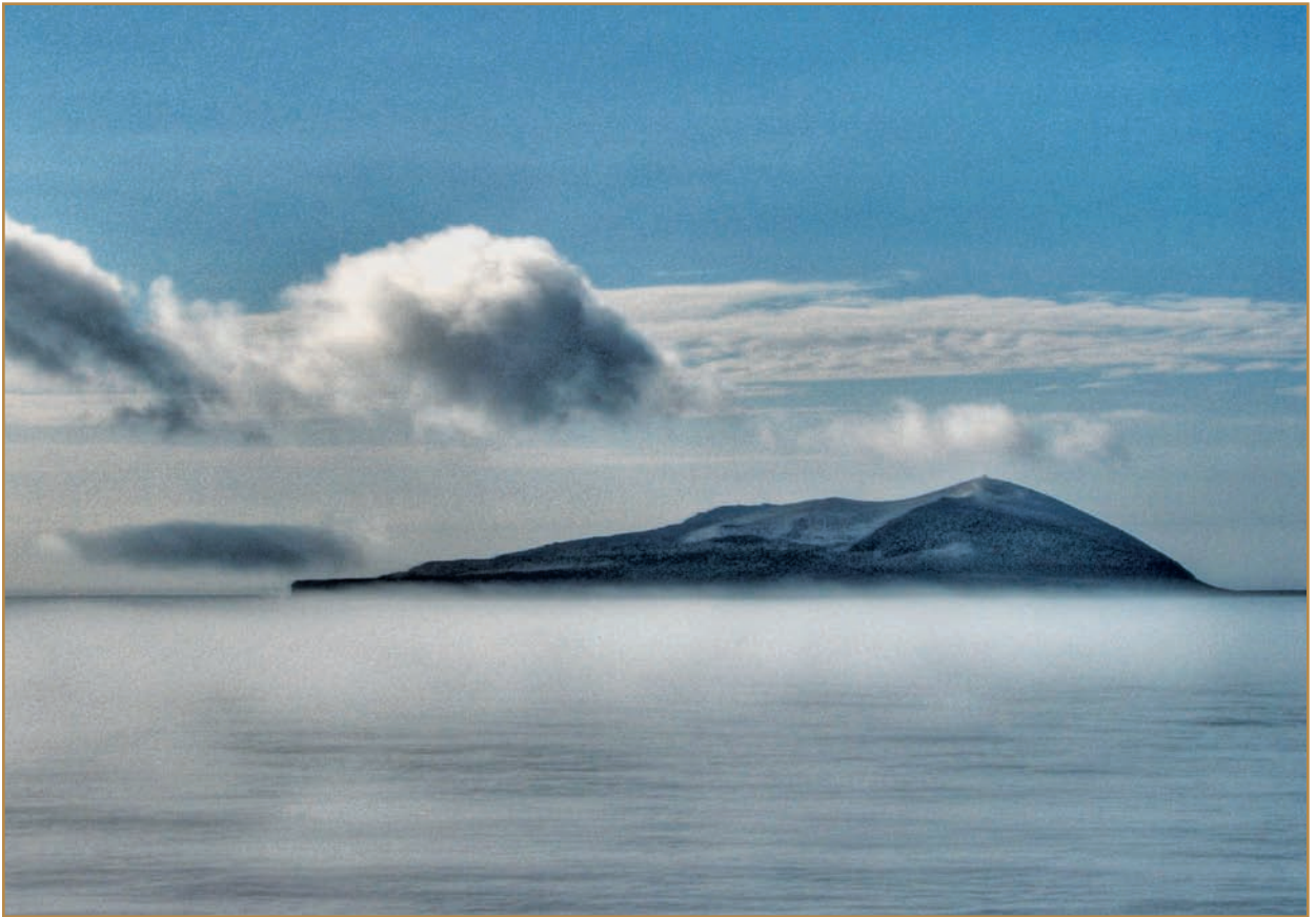
Surtsey Island

SVADILFARI The stallion belonging to the GIANT MASTER BUILDER who built the ASGARD wall. Svadilfari was a mighty animal, immensely powerful. He was lured from his task of helping the builder by a pretty mare (LOKI in disguise) and became the sire of SLEIPNIR, ODIN's eight-legged horse.