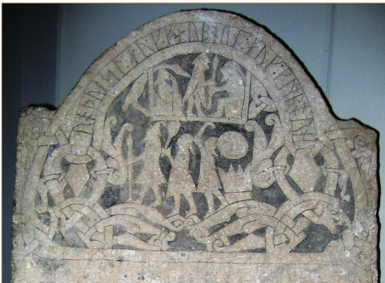
Gotland, Sweden, runestone depicting Thor, Odin, and Frey

Historically, the worship of Frey was widespread and persistent, especially among the people of SWEDEN. Around the year 1200, there was a magnificent statue of Frey (called there Fricco, the Lover) alongside the two other great gods ODIN and THOR in Uppsala, Sweden.