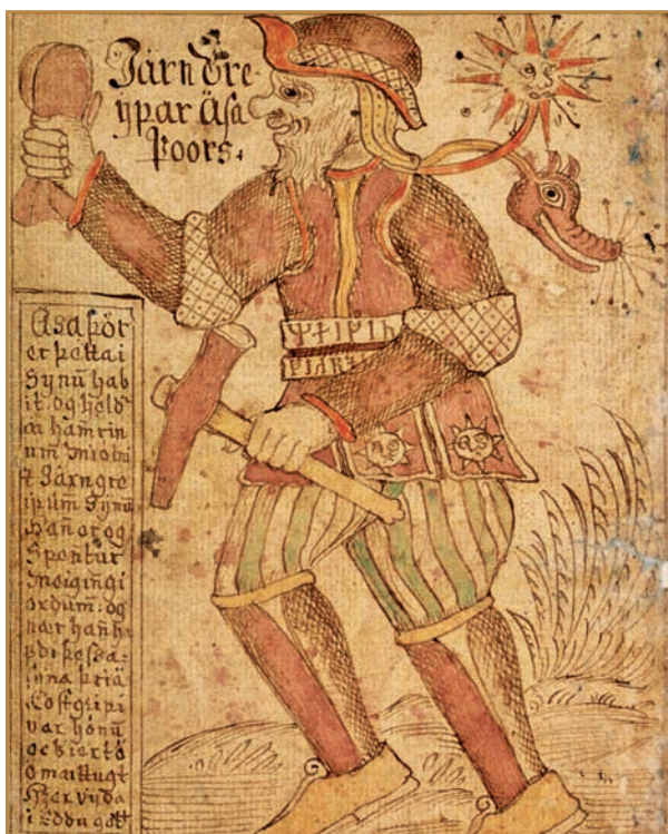
An illustration of Thor with his hammer Mjollnir. From the 18th-century Icelandic manuscript SÁM 66, in the care of the Árni Magnússon Institute in Iceland

made wooden oak chairs with high backs, called “high seats,” to ensure Thor’s blessing on the house (protecting it from lightning) and the well-being and fruitfulness of the family and its lands. As well as bringing thunder and lightning and storms, Thor sent the rain that made the fields fertile.