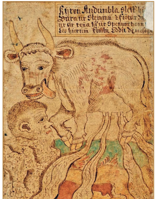
Audhumla licking Buri as four rivers of milk pour from her udders. From the 18th-century Icelandic manuscript SÁM 66, care of the Árni Magnússon Institute in Iceland

AURGELMIR According to the VAFTHRUDNISMAL , a poem in the POETIC EDDA , Aurgelmir was the first and oldest among the GIANTS and the grandfather of BERGELMIR. The poem Vafthrudnismal tells of the creation of the race of giants.