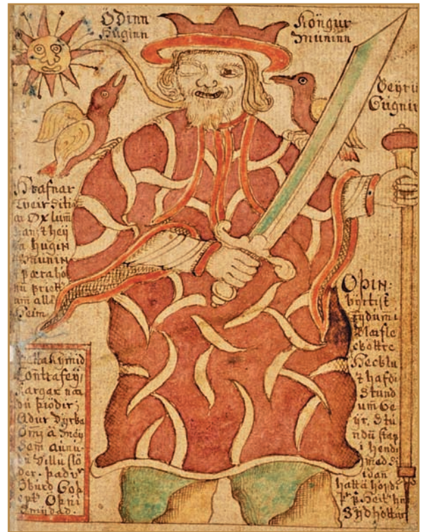
Odin with his ravens Hugin and Munin. From the 18th-century Icelandic manuscript SÁM 66, in the care of the Árni Magnússon Institute in Iceland

While debate exists over the dating and composition of the poem, it appears to have been first written down in Iceland in the late 1100s. Some experts suggest that the scribe who wrote it down condensed several poems into one. The main story of Hymiskvitha , however, which is that of Thor killing