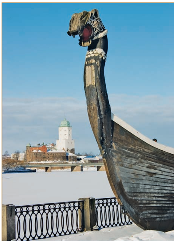
Detail of a Viking ship found in Vyborg, Russia

VILI According to SNORRI STURLUSON in GYLFA-GINNING , one of ODIN's brothers, along with VE; son of BOR and the GIANTESS BESTLA. Together the three sons of Bor created the Earth and the heavens from the body of the giant YMIR and the first HUMANS from