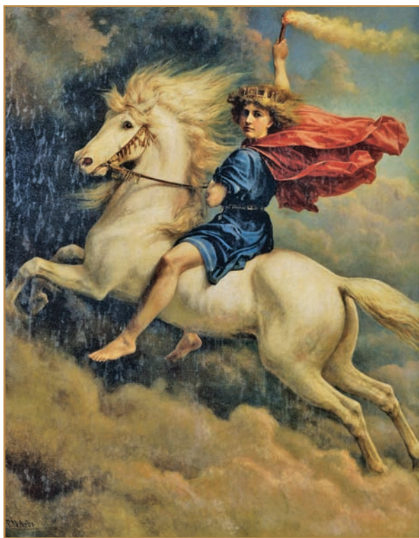
Peter Nicolai Arbo's painting of Dag riding Skinfaxi (1874)

DAIN (1) A DWARF mentioned only in HYNDLULJOTH , a part of the POETIC EDDA , as one of the creators of the gold-bristled boar HILDISVINI. According to this poem, Dain and his brother, NABBI, made the magical boar.