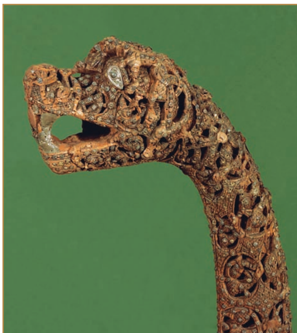
The decorative prow of the Oseberg ship in the Viking Ship Museum, Oslo, Norway ( Museum of Cultural History, University of Oslo, Norway )

LAY A short lyric or narrative (storytelling) poem, especially one intended to be sung, usually by traveling minstrels. These minstrels thus kept alive ancient