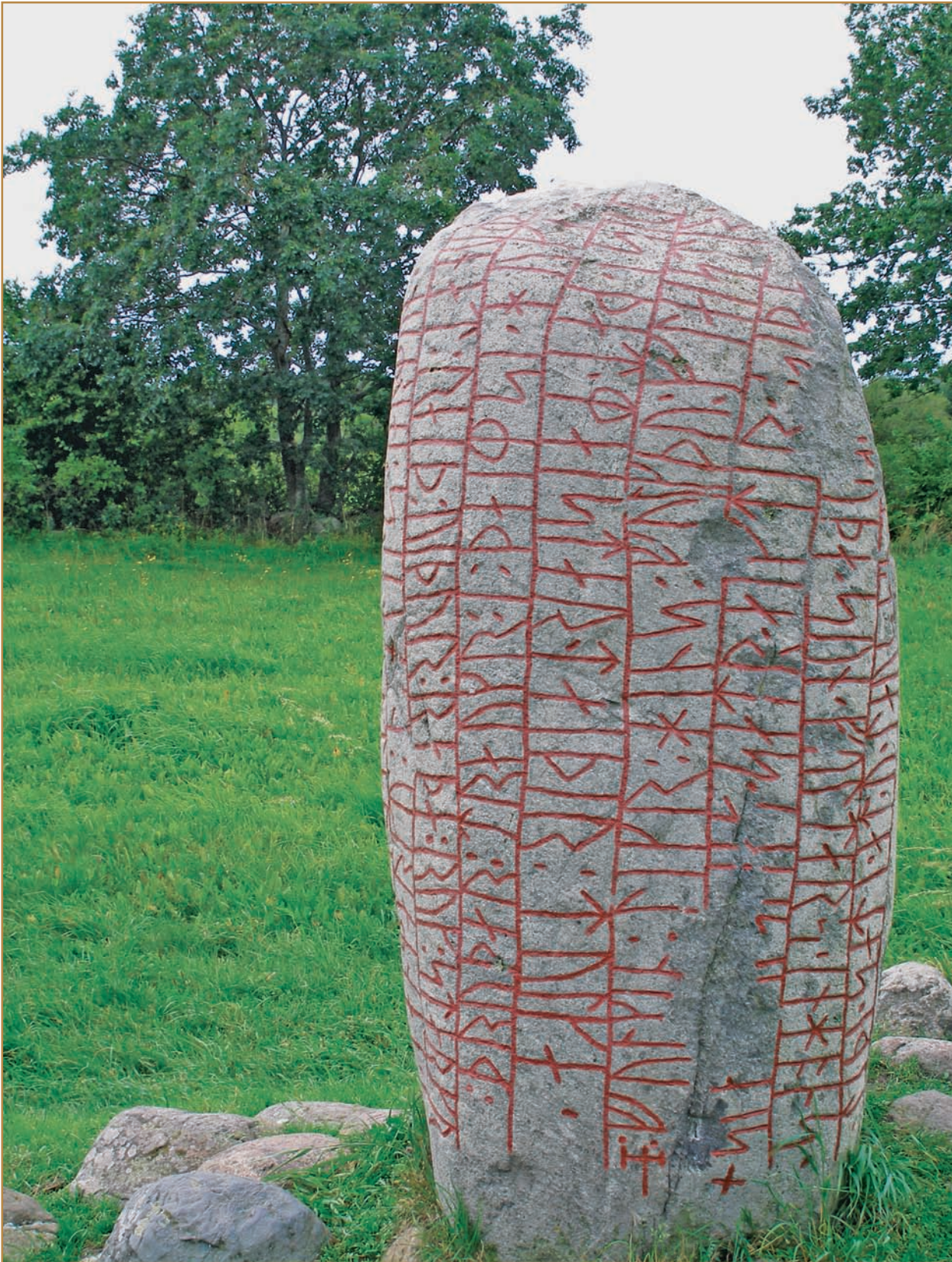
The Karlevi runestone on the island of Öland, Sweden, is commonly dated to the late 10th century. The carving contains a full stanza of skaldic poetry that translators say describes Odin.