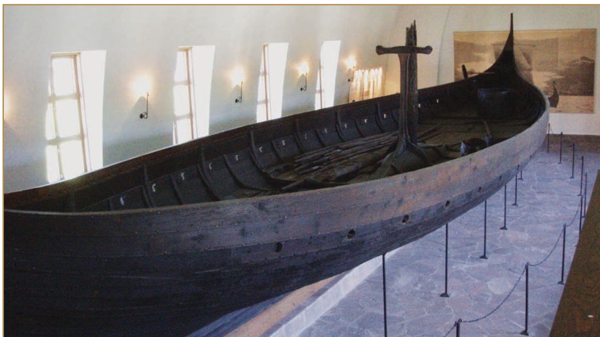
The Gokstad ship, a Norse burial ship from the late ninth century

HRUNGNIR Strongest of the GIANTS; described as large and stone-headed. Hrungrnir bet his horse GULLFAXI (Golden Mane) in a race with ODIN's eight-legged steed SLEIPNIR. He lost the race, then engaged in a duel with THOR, in which he was killed. SNORRI STURLUSON draws upon HAUSTLONG , a shield poem, or form of SKALDIC POETRY, for this tale.