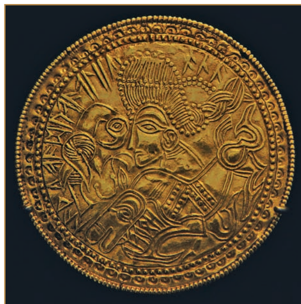
Bracteate from Funen, Denmark, featuring an inscription that includes the term “The High One,” a name for Odin

BREIDABLIK (Broad Splendor; Wide View) The shining hall of the god BALDER, located in ASGARD. Breidablik is the seventh of the gods’ homes described in the poem GRIMNISMAL . It is located in a land free from evil, where only fair things dwell, including