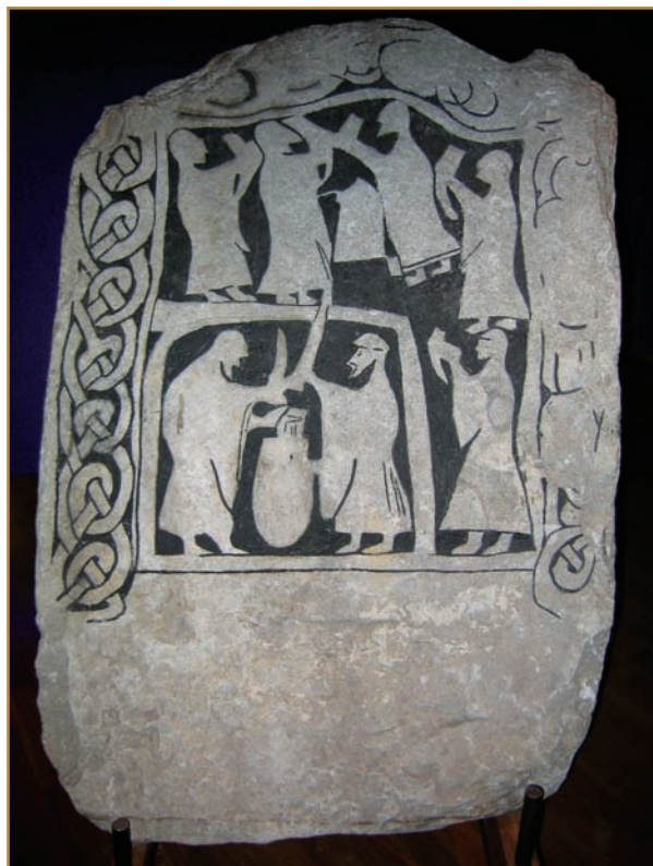
Depiction of warriors drinking mead on a runestone

MEGINGJARDIR (MEGINGJORD, MEGINGIORD, Power Belt) The name SNORRI STURLUSON gave to the god THOR's magic belt. When the thunder god fastens it on, his already great powers become twice as strong. Meginjardir was one of three of Thor's great treasures, which included his mighty hammer, MJOLLNIR, and iron gloves. The belt is