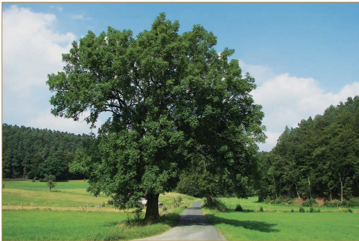
An ash tree in Burgwald, Hesse, Germany. The mythical tree Yggdrasil was of the same species.

YNGVI Another name, or perhaps title, for the god FREY; also possibly a little-known son of ODIN.