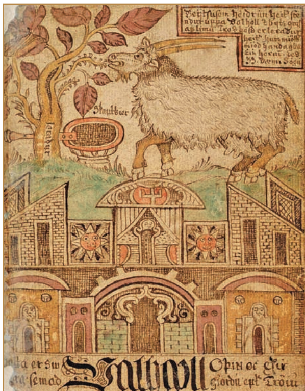
The goat Heidrun. From the 18th-century Icelandic manuscript SÁM 66, in the care of the Árni Magnússon Institute in Iceland.

Heimdall spotted sly LOKI from afar, after the trickster god had stolen FREYA’s necklace and escaped with it into the sea, where he changed himself into a sleek seal. Heimdall, too, was able to change his shape. He dived, seal-like, into the water, barking and nipping. Heimdall vanquished Loki and took the necklace back to Freya. He and Loki were enemies from then on and in the end would kill each other at RAGNAROK.