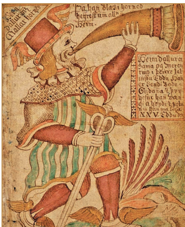
Heimdall with Gjallarhorn. From the 18th-century Icelandic manuscript SÁM 66, in the care of the Árni Magnússon Institute of Iceland

Heimdall was clever, too. He had the brilliant idea of sending the thunder god, THOR, to JOTUNHEIM dressed as a girl in bridal dress in order to get back Thor's magic hammer from the giant THRYM, who had stolen it.