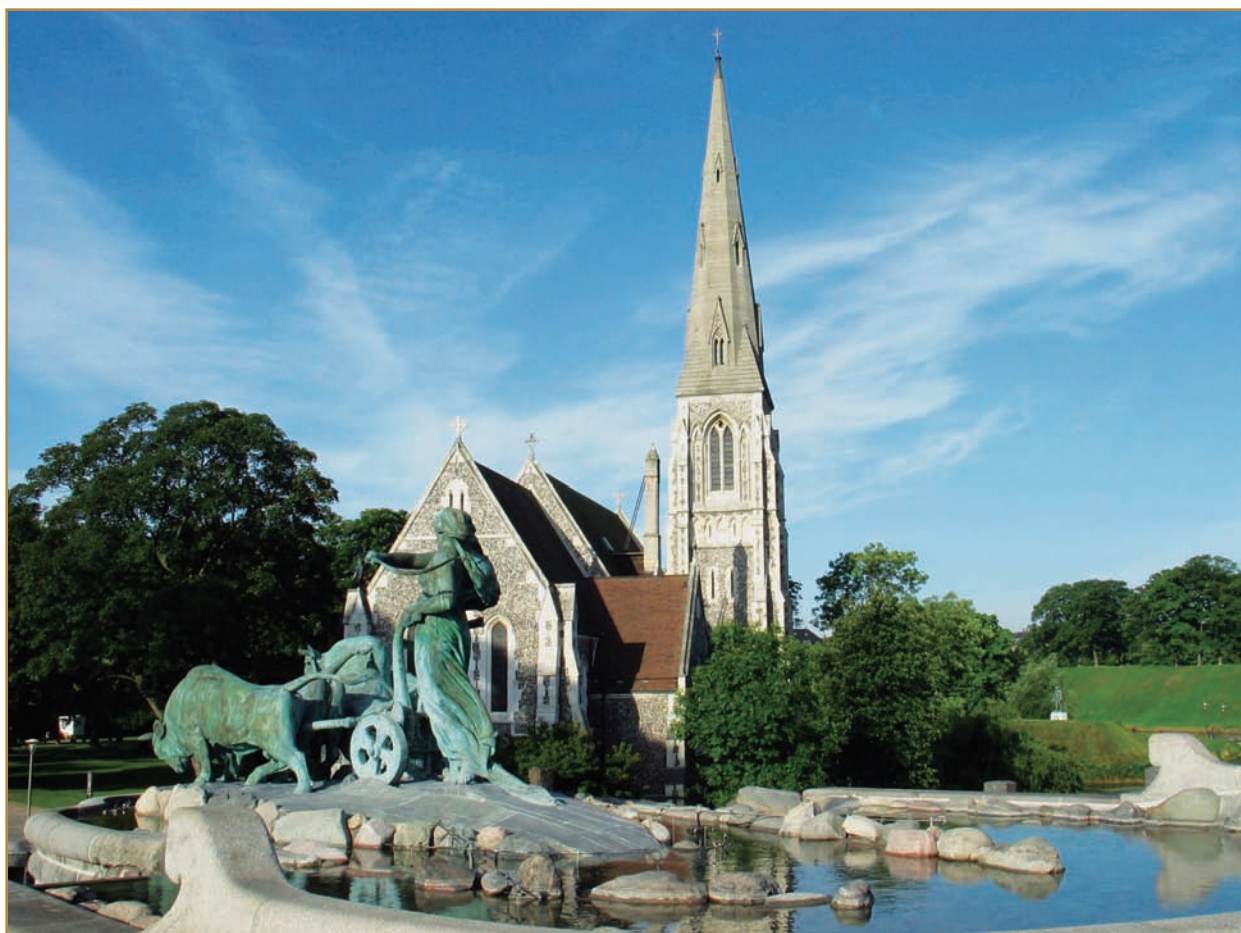
The Gefjon Fountain by Anders Bundgaard (1864–1937), in Langelinie, Copenhagen

able to kill Geirrod and his two ogress daughters, GIALP and GREIP.