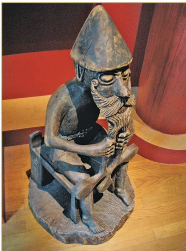
A wooden reproduction of an Icelandic statue of Thor at the Swedish Army Museum

Once safe in Asgard, Loki prattled on to anyone who would listen about the wonders of Geirrod's castle and how the giant was eager to meet the