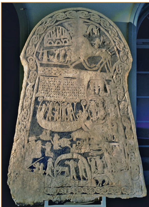
Gotland, Sweden, runestone depicting various mythological figures

GREAT BRITAIN Geographically, Great Britain is the largest of the islands in the British Isles, which are to the northwest of the main European continent. Politically, Great Britain is formed by the countries of England, Scotland, and Wales and forms a part of the United Kingdom of Great Britain and Northern Ireland.