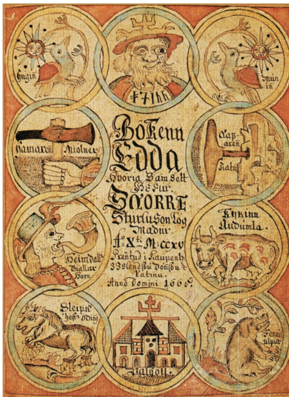
Title page of a manuscript of the Prose Edda , showing Odin, Heimdall, Sleipnir, and other mythological figures. From the 18th-century Icelandic manuscript IB 299 4to, in the care of the Icelandic National Library